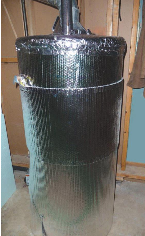
Wrapped Hot Water Tanks