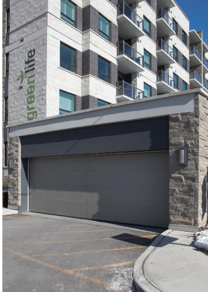
Covered Garage Entrances